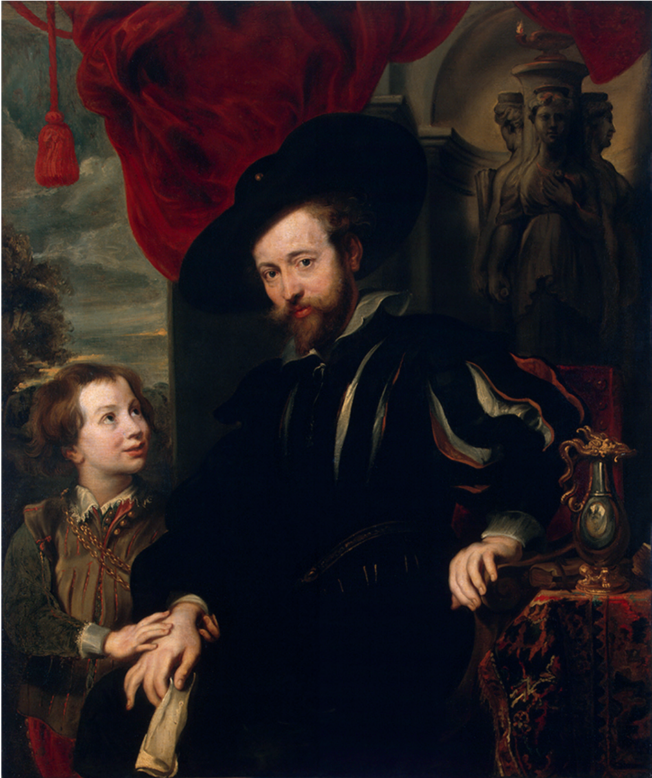
Fig. 1 Anonymous artist, Rubens and his son Albert, 133.5×112.2 cm, St. Petersburg, The State Hermitage Museum, inv. no. GE 7728, photograph © The State Hermitage Museum, photo by Vladimir Terebenin.

female caryatids forming the statue of Hecate as the Three Graces and he interpreted the visible lines of the drawing as an architectural design. 3 This led him to conclude that the portrait should be understood as a ‘situation pédagogique’ with Rubens teaching