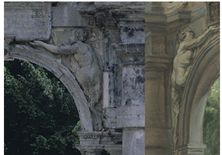
Fig. 7b left & right The female satyr holding the cartouche on the left ( fatum ) is transformed into a male satyr and placed to the right side of the portico in Isabella's portrait.