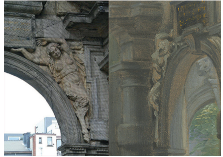
Fig. 7a left & right The female satyr holding the cartouche on the right ( virtus ) is placed to the left side of the portico in Isabella's portrait.

ostensible age in the picture. 88 However, the presence of Hecate as goddess of the underworld suggests to me that the painting might somehow commemorate the death of Isabella and therefore be executed after 1626. Moreover, the goddess's role as fatum and providence, a force contrasted by virtus , recalls the Juvenal's inscriptions at the side arches of the portico of the Rubens House. The inscription on the left is concerned with the necessity of accepting one's fate; the other, complementary to the first, is a reminder and a practical advice to achieve virtue through self-control. 89 Curiously, Van Dyck painted the portico in mirror image, so that the position of the pair of satyrs and panels above the archways is inverted. He also gave the female satyr holding the cartouche on the left ( fatum ) – placed to the right – male features (figs. 7a–7b). 90 In Isabella's portrait the panel on the right ( virtus ) is situated on the left side, while the other panel ( fatum ) is cut off. What were Van Dyck's reasons for doing this? The changes Van Dyck made admit, in my opinion, a reasonable explanation if we accept the portrait of Rubens and his son as a pendant to Isabella's portrait. The panel