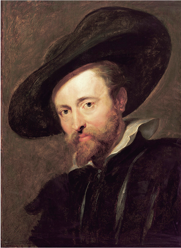
Fig. 2 Peter Paul Rubens, Self-portrait, c. 1622–1630, inv. no. RH.S.180, Rubenshuis, Antwerp